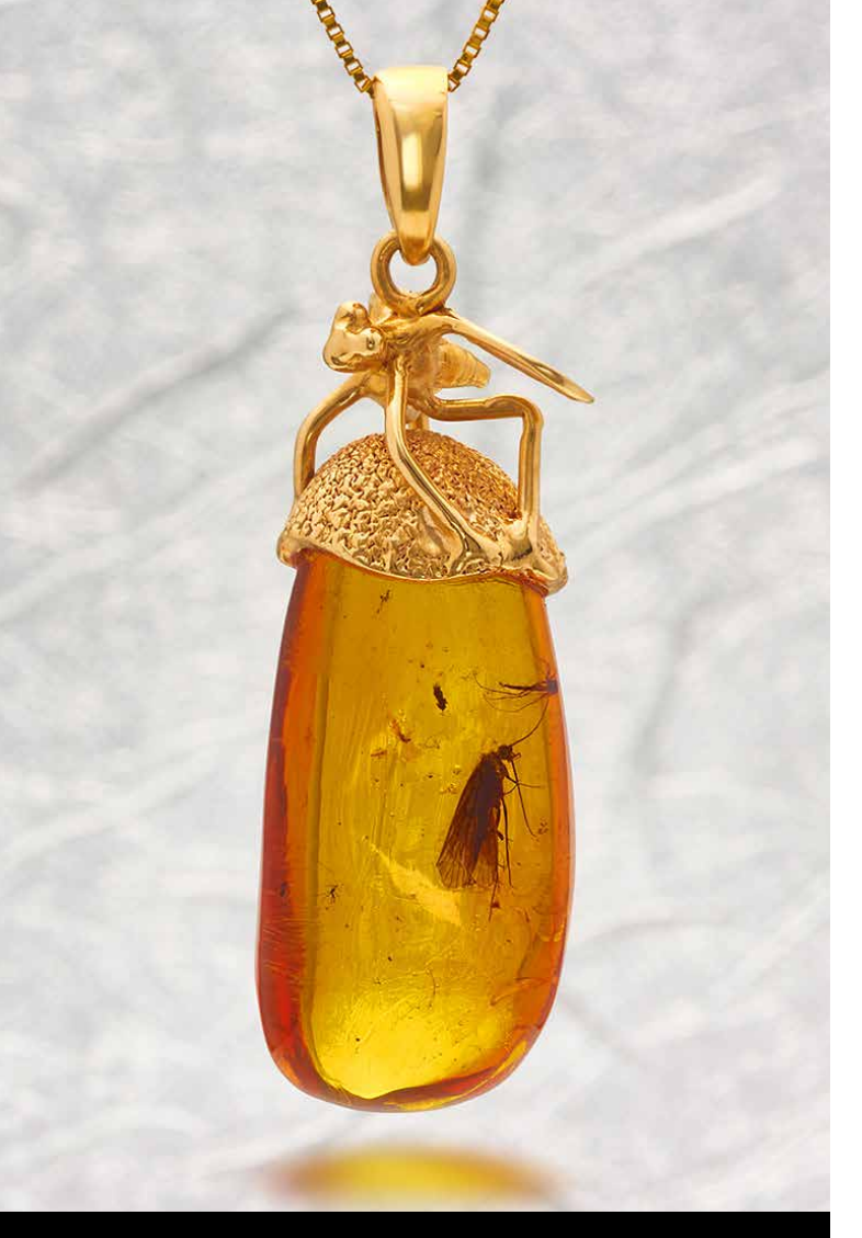
Vintage inspired Contemporary Baltic Amble gold pendant.

Amber and Copal are easily confused. While Copal is also made from tree resin, it's not nearly as old as Amber. What makes Amber have the demand and value that it does is its age. Copal is softer and does not have the same properties as Amber because it hasn't had enough time to fossilize. Copal resin most often comes from the aromatic copal tree and can also be burned as incense.