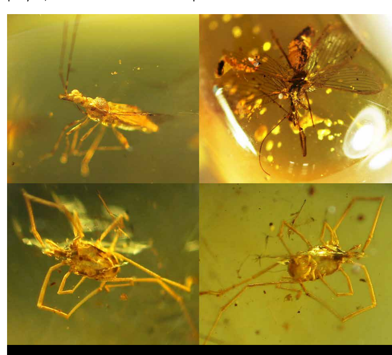
Amber and amber inclusions are increasingly important for making discoveries and conclusions about the life that existed on Earth millions of years ago.

Dominican Amber is the youngest, between 16 and 20 million years old. All Dominican Amber is fluorescent, and the rarest color is blue. It turns blue in natural sunlight or any other partially or wholly ultraviolet light source. In long-wave UV light, it reflects white. Only about 100 kg or 220 lbs is found per year, which makes it valuable and expensive.